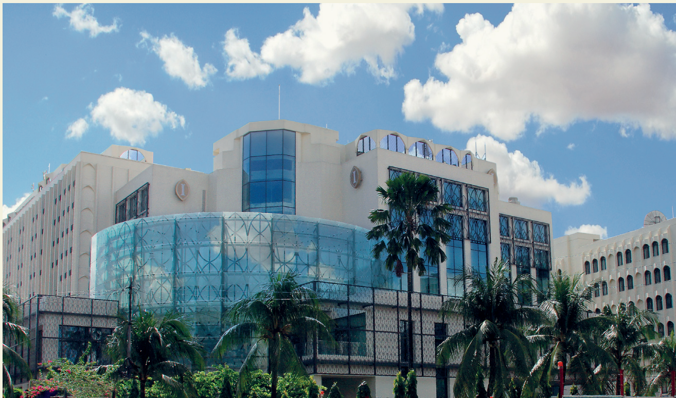
Hotel InterContinental Dhaka

InterContinental Hotel 1 Minto Road, Dhaka, Bangladesh Tel: +88-02-55663030